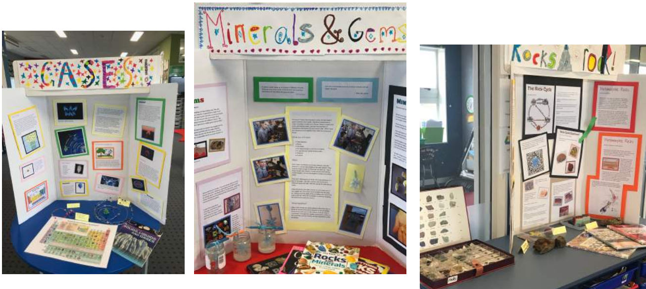
Science project boards in Kia Hari

Year 3-6 children shared their learning with their parents at CaPT conferences this week. In their learning spaces there were displays of some of the great learning that has been happening, especially in science. Thank you to all the parents who came along to support their children in their learning.